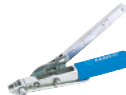
J02069 Pok-It II Tool with Cutter

*BAND-IT reserves the right to substitute material with equal or better corrosion resistance and/or mechanical specifications.