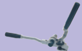
C40099 Ratchet Tool