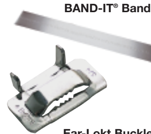
BAND-IT ® Band