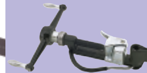
C00369 BAND-IT ® Heavy Duty Tool