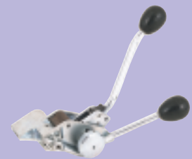
C08569 Bantam Strapping Tool