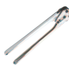
SEALER Part No. SF1606 (12mm) Part No. SF1607 (16mm)