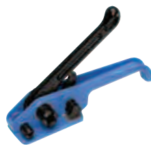
SWISS TENSIONER Part No. SF1400