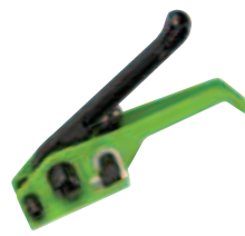
STANDARD TENSIONER Part No. SF1402