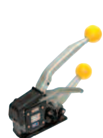
12 & 16mm FROMM COMBINATION TOOL Part No. SF1608 (12mm) Part No. SF1609 (16mm)