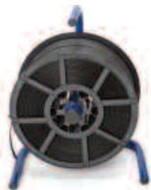
STATIC DISPENSER PLASTIC REELS Part No. SF1640