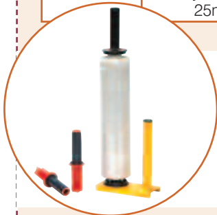
PALLET WRAP HAND APPLICATOR Part No. SF1700