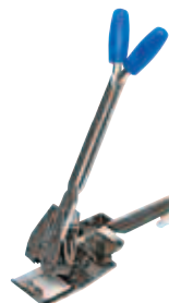
HD COMBINATION Part No. SF1650 (12mm) Part No. SF1651 (16mm)