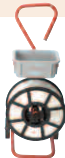
MOBILE DISPENSER Part No. SF1641